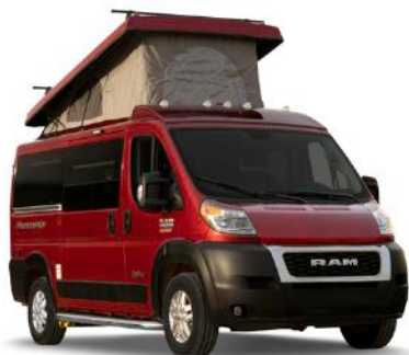
Deep Cherry Red Crystal Pearl