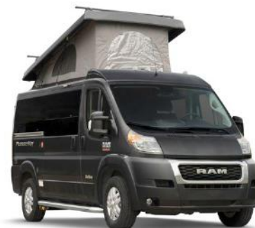
Granite Crystal Metallic