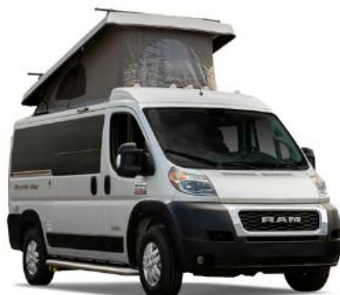
Bright Silver Metallic